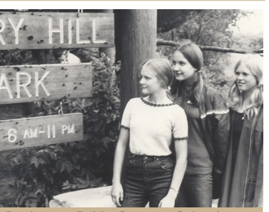
Rochester Public Summer School students; West Entrance to newly formed Quarry Hill Park. circa 1968